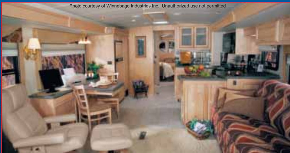
Photo courtesy of Winnebago Industries Inc. Unauthorized use not permitted